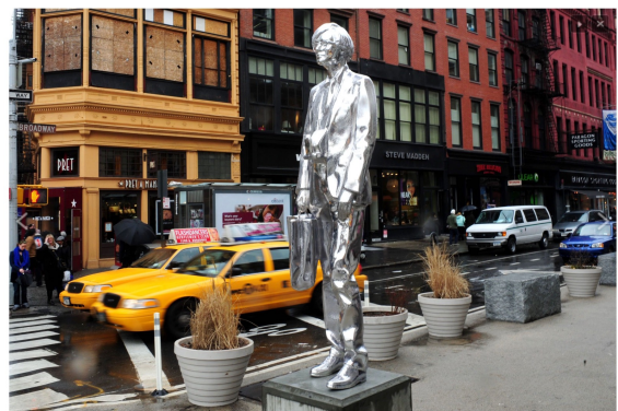
The Andy Monument, Union Square, New York, America Andy Warhol statue unveiled in Union Square, New York, America - 30 Mar 2011 The Andy Monument, by artist Rob Pruitt

„For me NYC was always a happening place for everything. In regards to the art world I thought of it as the epicenter but as time passes everything changes.“